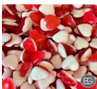
Haribo Heart Throbs

Glucose Syrup, Sugar, Gelatine, Dextrose, Fruit Juice from Concentrate: Apple, Strawberry, Raspberry, Orange, Lemon, Pineapple, Acid: Citric Acid, Fruit and Plant Concentrates: Nettle, Orange, Lemon, Mango, Passion Fruit, Elderberry, Blackcurrant, Apple, Spinach, Aronia, Kiwi, Grape, Flavouring, Elderberry Extract, Glazing Agents: Beeswax, Carnauba Wax, Carob Extract, Invert Sugar Syrup