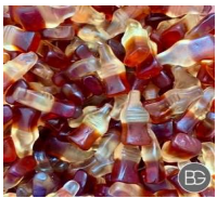
Haribo Cola Bottles

Glucose Syrup, Sugar, Gelatine, Dextrose, Acid: Citric Acid, Flavouring, Fruit and Plant Concentrates: Apple, Aronia, Blackcurrant, Elderberry, Grape, Kiwi, Nettle, Spinach, Glazing Agents: Beeswax, Carnauba Wax, Invert Sugar Syrup, Elderberry Extract, Carob Extract