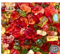
Haribo Gold Bears

Glucose Syrup, Sugar, Starch, Acid: Citric Acid, Flavouring, Fruit and Plant Concentrates: Apple, Aronia, Blackcurrant, Elderberry, Grape, Kiwi, Nettle, Spinach, Glazing Agents: Beeswax, Carnauba Wax, Invert Sugar Syrup, Elderberry Extract, Carob Extract