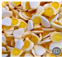
Haribo Fried Eggs

Glucose Syrup, Sugar, Gelatine, Dextrose, Acid: Citric Acid, Caramelised Sugar Syrup, Flavouring, Glazing Agents: Beeswax, Carnauba Wax