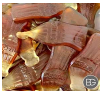
Haribo Giant Cola Bottles

Glucose syrup, Sugar, Pork Gelatine, Dextrose, Acid (Citric Acid), Flavouring, Fruit and Plant Concentrates (Apple, Aronia, Blackcurrant, Elderberry, Grape, Kiwi, Lemon, Mango, Orange, Passion Fruit, Safflower, Spirulina), Glazing Agents (Beeswax, Carnauba Wax), Caramelised Sugar Syrup, Elderberry Extract.