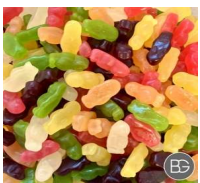
Haribo Jelly Babies

Glucose Syrup, Sugar, Dextrose, Gelatine, Acid: Citric Acid, Flavouring, Fruit and Plant Concentrates: Aronia, Blackcurrant, Elderberry, Grape, Glazing Agents: Beeswax, Carnauba Wax, Elderberry Extract