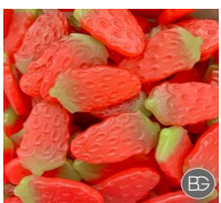
Haribo Giant Strawberries

Glucose Syrup, Sugar, Gelatine, Dextrose, Acid: Citric Acid, Caramelised Sugar Syrup, Flavouring, Glazing Agents: Beeswax, Carnauba Wax