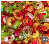
Haribo Friendship Rings

Glucose Syrup, Sugar, Dextrose, Gelatine, Acid: Citric Acid, Flavouring, Fruit and Plant Concentrates: Apple, Aronia, Blackcurrant, Carrot, Elderberry, Grape, Hibiscus, Kiwi, Lemon, Mango, Nettle, Orange, Passion Fruit, Spinach, Glazing Agents: Beeswax, Carnauba Wax, Carob Extract