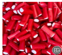
Mini Strawberry Cables