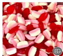
Teeth & Lips

Sugar, glucose syrup, WHEAT starch, water, modified maize starch, modified potato starch, acids (lactic acid, malic acid, citric acid), flavourings, fruit and vegetable concentrates (spirulina, safflower, black carrot, grape), colours (curcumin, paprika extract), vegetable oils (coconut), glazing agent (carnauba wax).